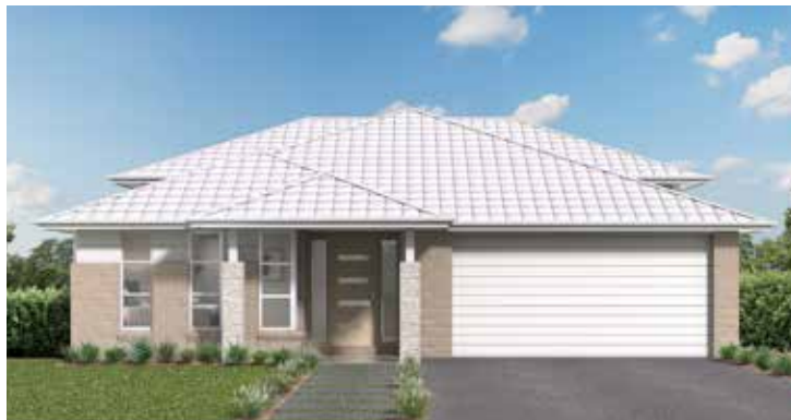
Cosmo Facade Roof Type Tiles Total m²/Sq 266.87/28.7