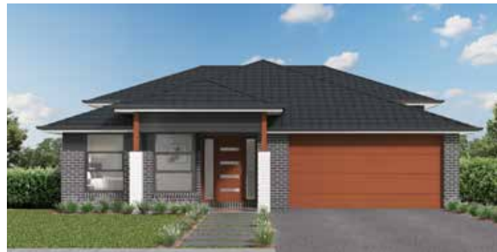
Executive Facade Roof Type Tiles Total m²/Sq 267.54/28.8