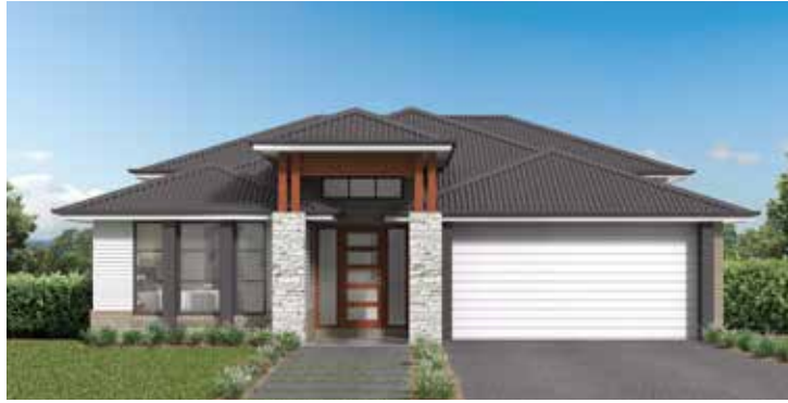
Grande Facade Roof Type Colorbond Total m²/Sq 266.89/28.7