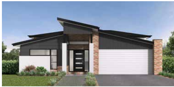
Retro Facade Roof Type Colorbond Total m²/Sq 266.75/28.7