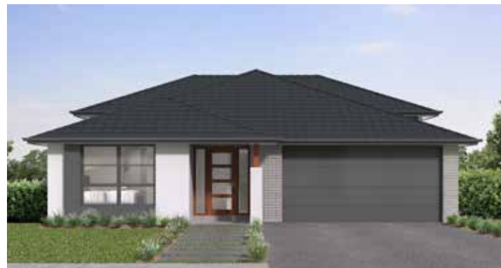
Metro Facade Roof Type Tiles Total m²/Sq 263.73/28.4