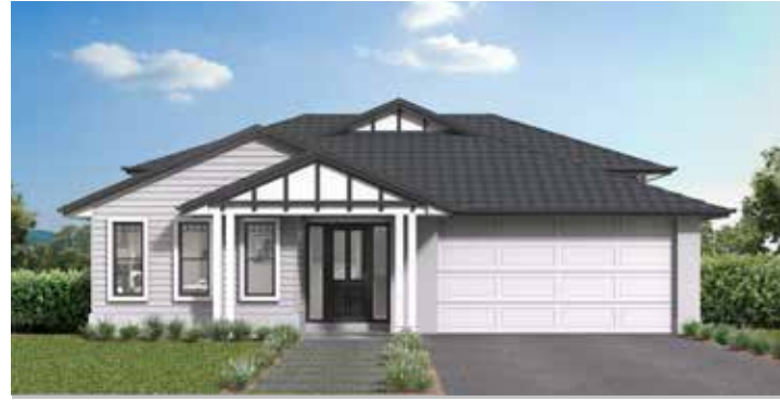
Hamptons Facade Roof Type Tiles Total m²/Sq 267.73/28.8