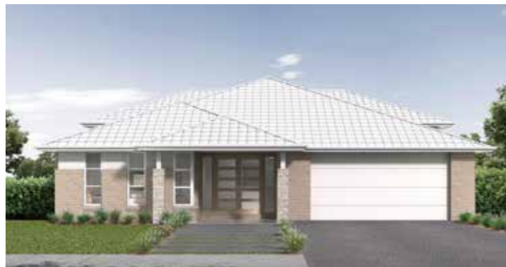
Cosmo Facade Roof Type Tiles Total m 2 /Sq 353.02/37.9