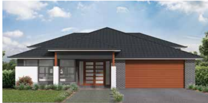
Executive Facade Roof Type Tiles Total m 2 /Sq 353.53/38.0