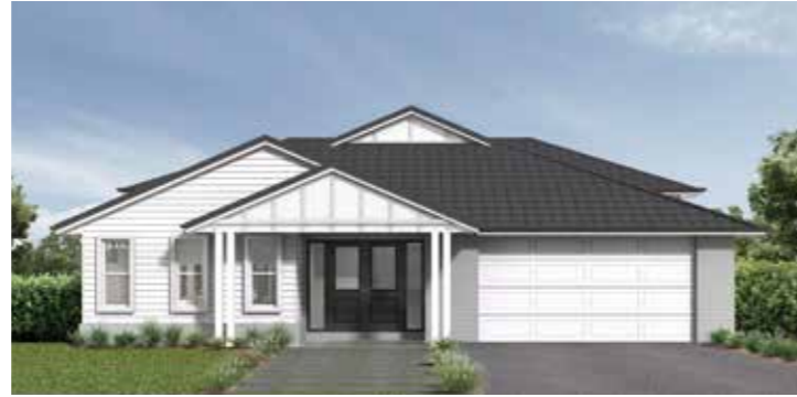
Hamptons Facade Roof Type Tiles Total m 2 /Sq 353.94/38.1