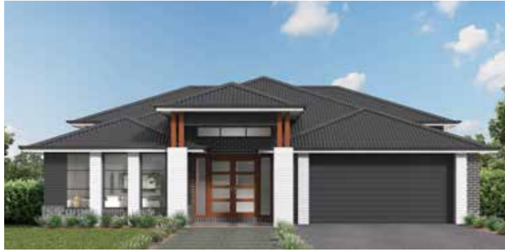
Grande Facade Roof Type Colorbond Total m 2 /Sq 353.09/38.0