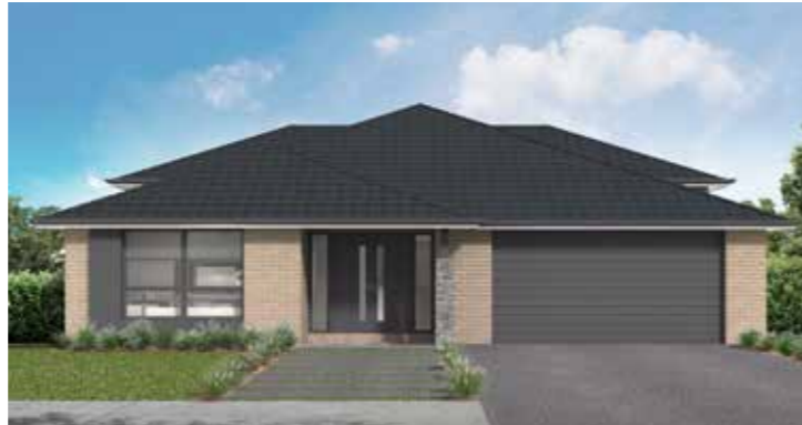
Metro Facade Roof Type Tiles Total m 2 /Sq 349.02/37.5