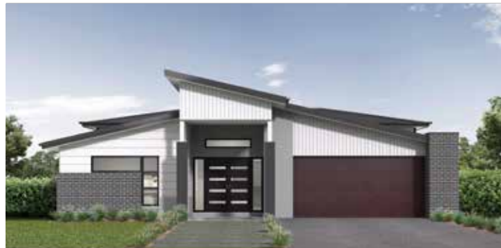
Retro Facade Roof Type Colorbond Total m 2 /Sq 353.04/38.0